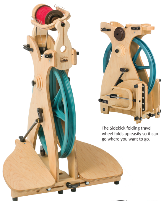
The Sidekick folding travel wheel folds up easily so it can go where you want to go.

This pint-sized gem is our answer to everything we wanted to see in a folding travel wheel: a terrific little spinner, comfortable (made so by our long curvy treadles and an orifice height of 25"), stable, and easy to fold and unfold. We employed quite a lot of bicycle technology in the Sidekick design: The drive wheel is turned 90 degrees as on a bicycle, we use a precise tension control for the drive band, and quick-release levers for easy folding and unfolding.