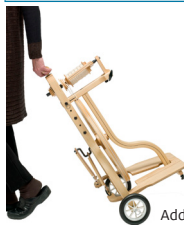
Add a Matchless Cart for portability.