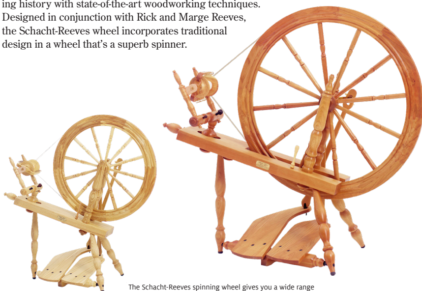
The Schacht-Reeves spinning wheel gives you a wide range of ratios to make your spinning smooth and easy. Left: 24" ash double treadle. Right: 30" cherry double treadle.