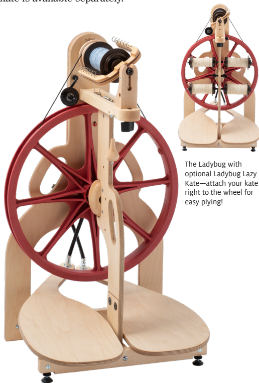
The Ladybug with optional Ladybug Lazy Kate—attach your kate right to the wheel for easy plying!

Friendly to entry-level and seasoned spinners alike, our Ladybug spinning wheel is easy to treadle, easy to take with you...and as cute as a bug! With solid Schacht construction and an eye-catching design, the Ladybug is both functional and charming. Made of maple plywood and solid maple, the Ladybug sports integrated carrying handles. Its attached lazy kate is available separately.