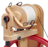
The Ladybug with Bulky Plyer Flyer (also available for Sidekick, Flatiron, and Matchless spinning wheels).