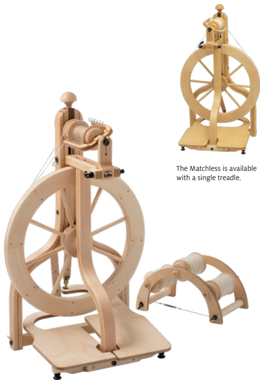
The Matchless is available with a single treadle.

Responsive, versatile, comfortable, our Matchless Spinning Wheel combines contemporary styling with an integrated blend of design and function. In every detail, from our individually balanced flyer to fine-tuning tensioning, the Matchless Spinning Wheel is designed to give the highest performance in a wheel that is both light treading and comfortable to use.